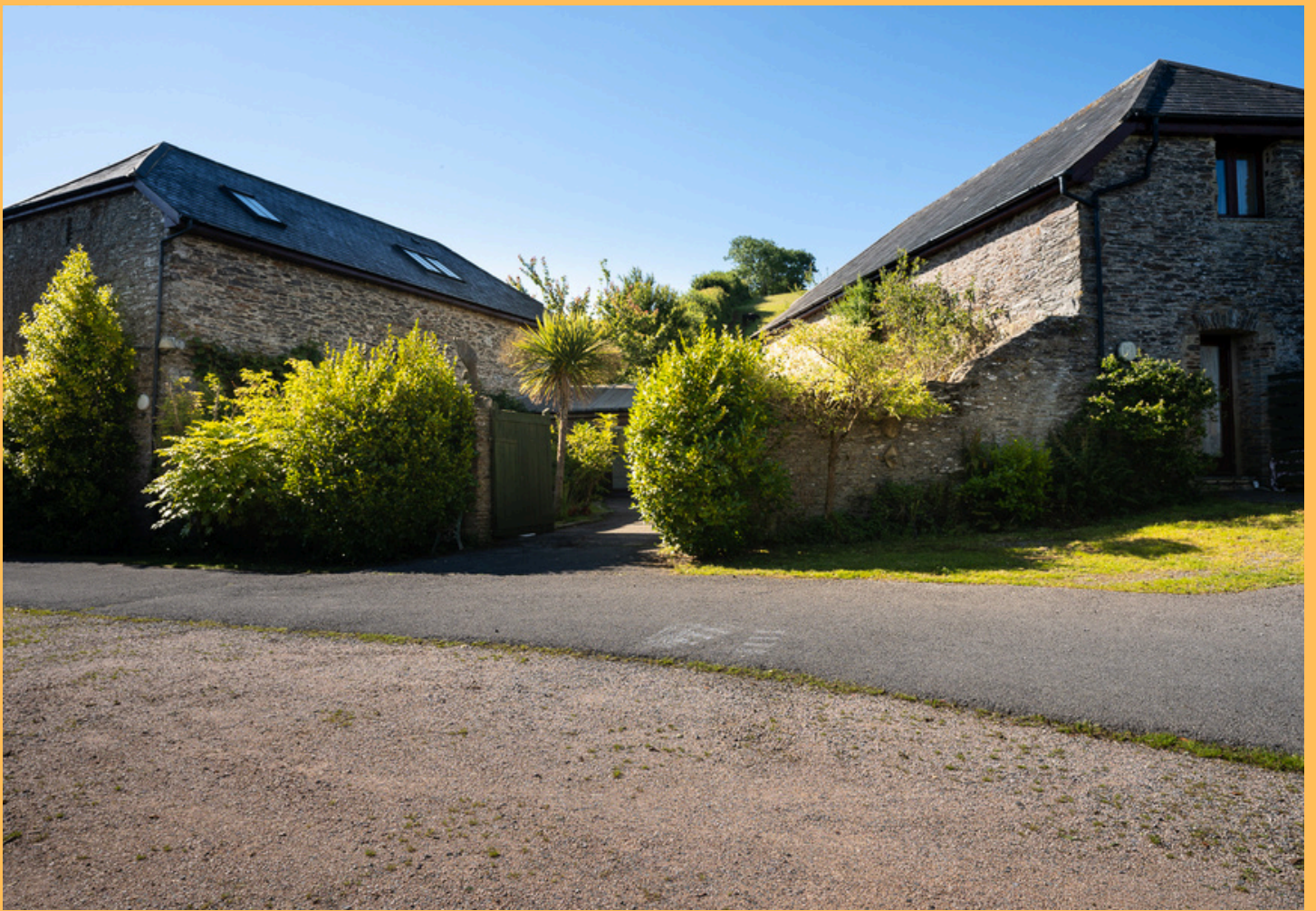
Eden Rise - a haven for wellbeing