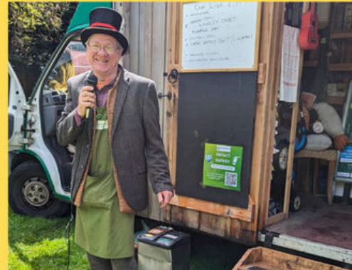
WoolFest Buckfastleigh 2024