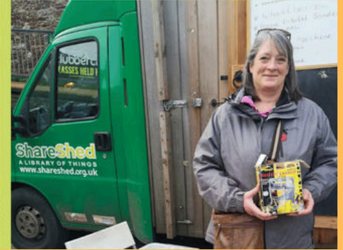
Share Shed Members